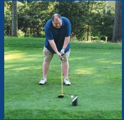
PVA-WI participated and sponsored a hole for the 19th Annual Fisher House Wisconsin Golf Outing.