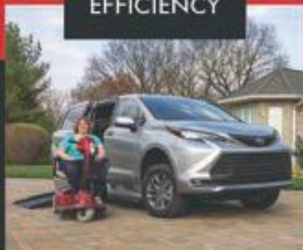
TOYOTA SIENNA HYBRID