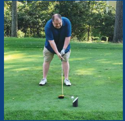
PVA-WI participated and sponsored a hole for the 19th Annual Fisher House Wisconsin Golf Outing.