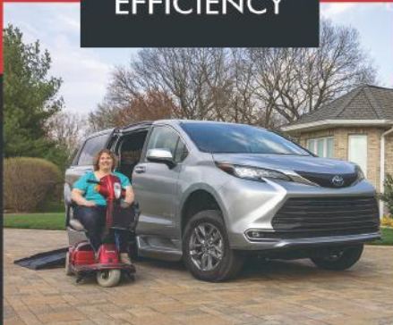
TOYOTA SIENNA HYBRID