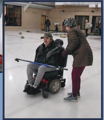
Wauwatosa Curling Club Wauwatosa, WI