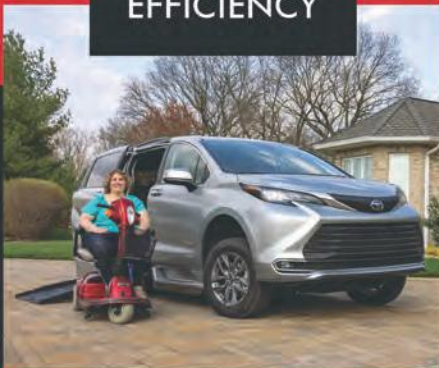
TOYOTA SIENNA HYBRID