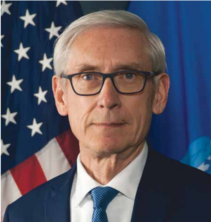
Tony Evers , Governor Democrat

Personal: Born Plymouth, Wisconsin, November 5, 1951; married; 3 children, 9 grandchildren.